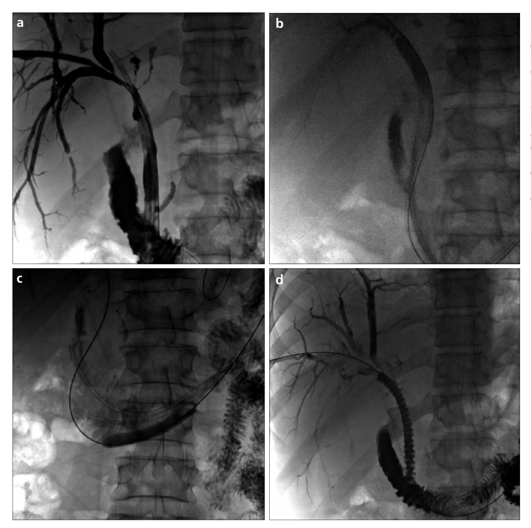
Figure 1. a-d. A 34-year-old patient with metastatic gastric carcinoma having two plastic stents in the common bile duct. A superstiff guidewire is seen in the duodenum, and an introducer sheath was placed through the right hepatic ductus (a). Inflation of the balloon catheter at the proximal part of the common bile duct (b) is seen. Both dysfunctioning endoprostheses were dislodged into the duodenum by friction of the balloon (c). Percutaneous metallic stenting was performed in the same session (d).

The mean interval time between plastic stent insertion and percutaneous biliary drainage was 27 days (range, 8–92 days; n=24). However, the interval time could not be determined in 19 patients. Nine of the patients had two plastic endoprostheses in the biliary tree. Forty-nine endoprostheses were straight polyethylene stents and three were double-J type plastic stents (52 endoprostheses in total). The plastic endoprostheses ranged in diameter from 7 to 10 F (n=25). No data were available for 18 patients regarding the diameter of the plastic stents inserted.